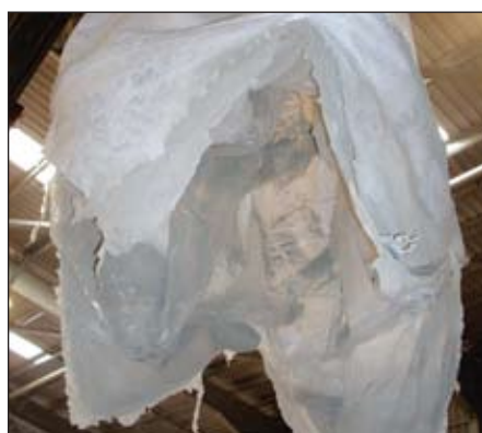
Left: Clean remnants of bag, with no dust.