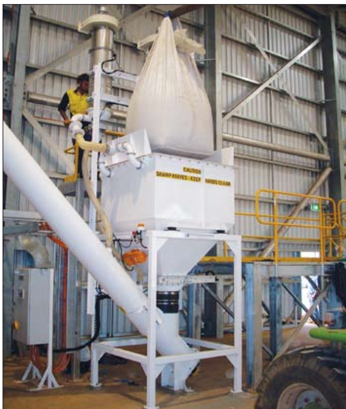
Bulk bag of cement entering bag slitter.