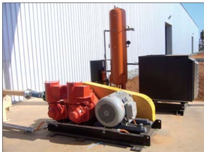
55kw power pack for pneumatic conveying, with instrument air compressor behind.