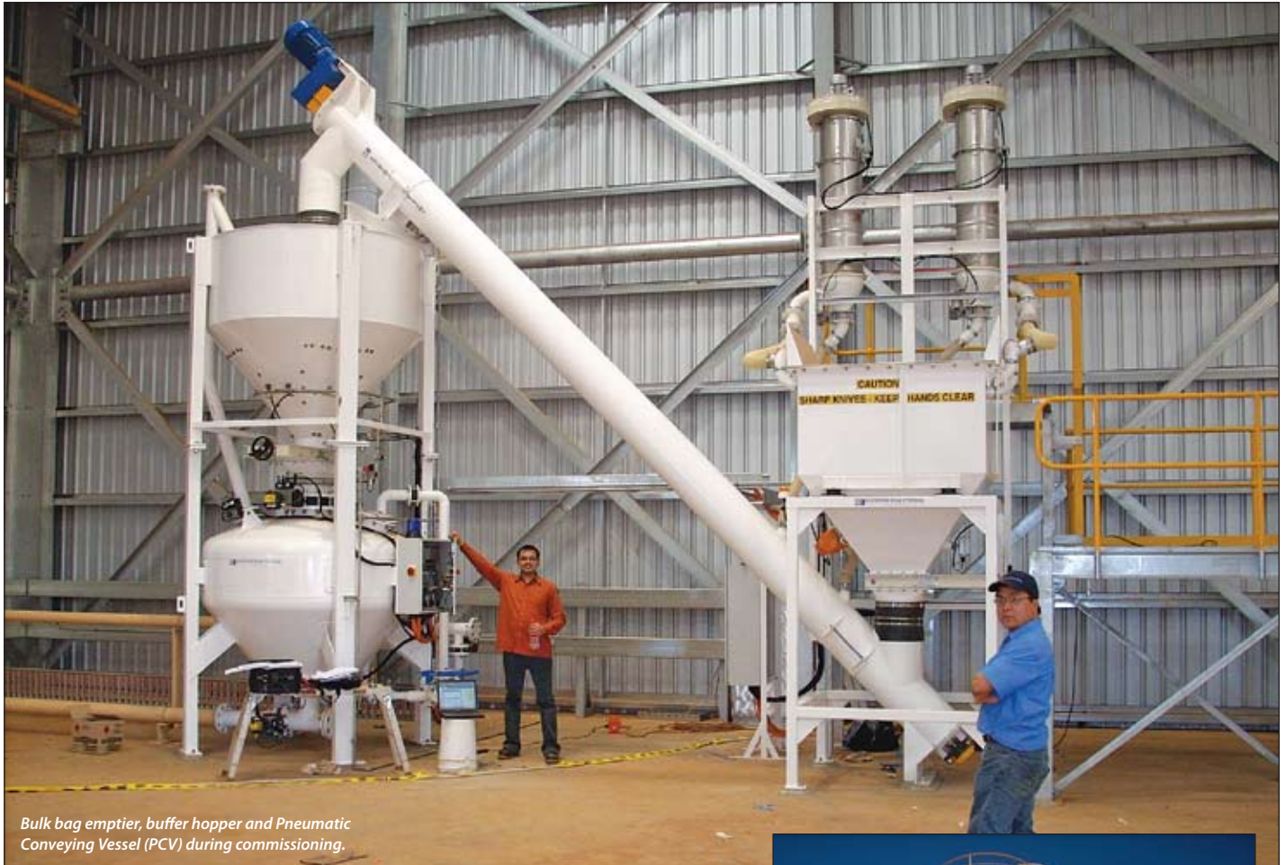
Bulk bag emptier, buffer hopper and Pneumatic Conveying Vessel (PCV) during commissioning.