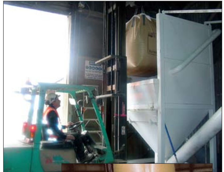
Above: The more conventional method of loading a bulk bag emptier by using a fork-lift truck.

According to Kockums Bulk Systems, the PCV transfer system utilising dense phase transfer is a very economical and