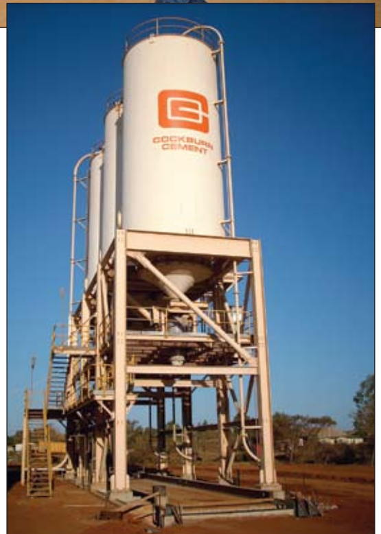
Silo nest for tanker loading.

switches to the next silo in sequence," said Colin Powers of Cockburn Cement.